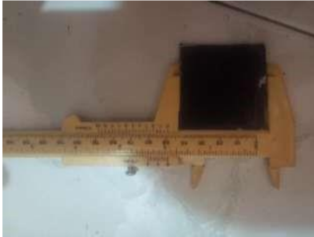
Gambar Pengukuran Alat Uji 5cm x 5cm