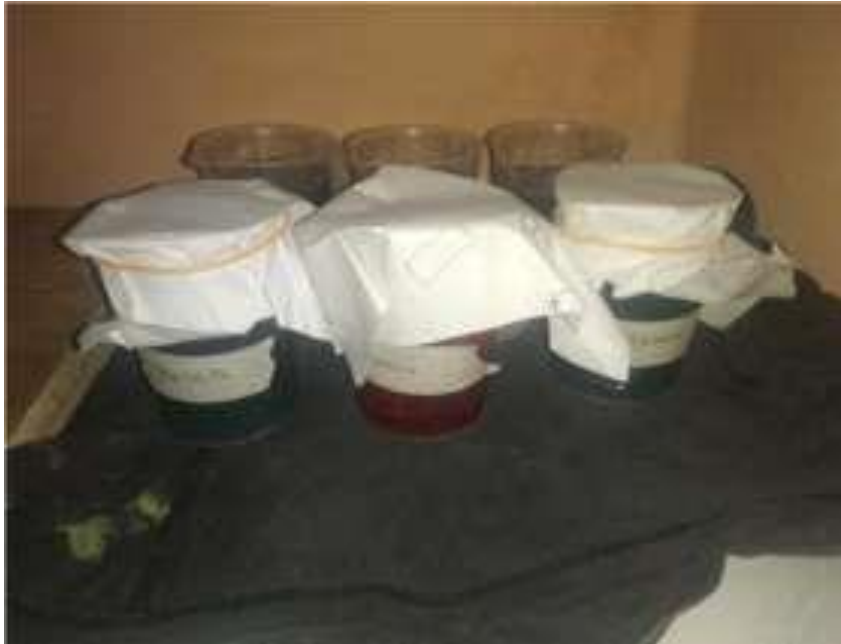
Gambar Perendaman Plat