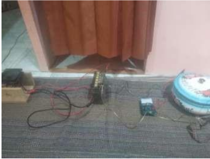
Gambar Rangkain Alat Uji