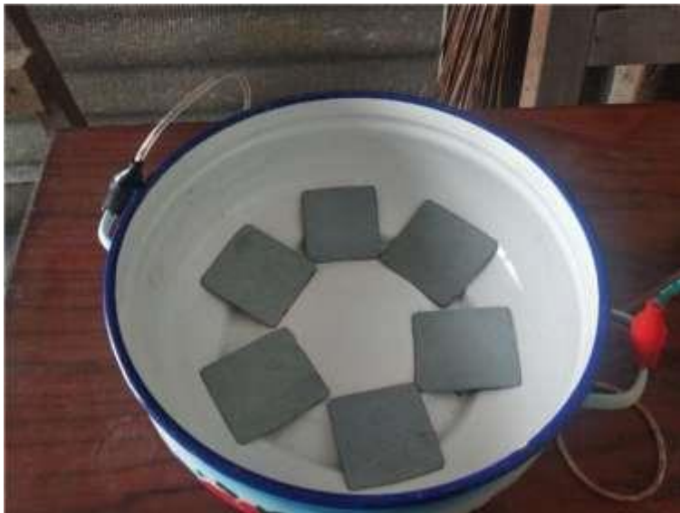
Gambar Plat Uji Yang Sudah Dipotong