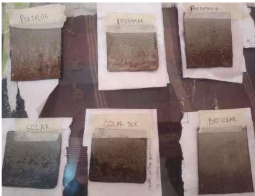
Gambar hasil Pengkorosian