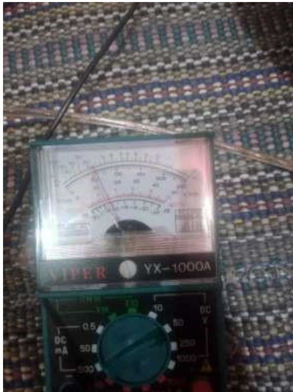
Gambar Avometer Alat Uji