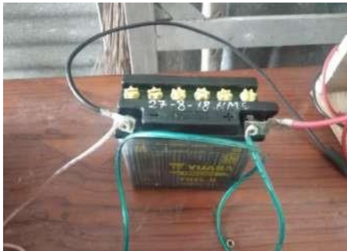
Gambar.Accu 12v pengujian korosi