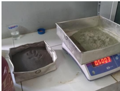
Gambar A2. Penimbangan Material