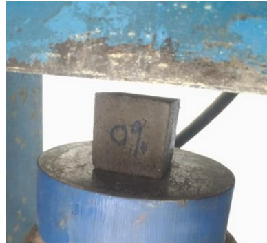
Gambar A5. Pengetesan Benda Uji