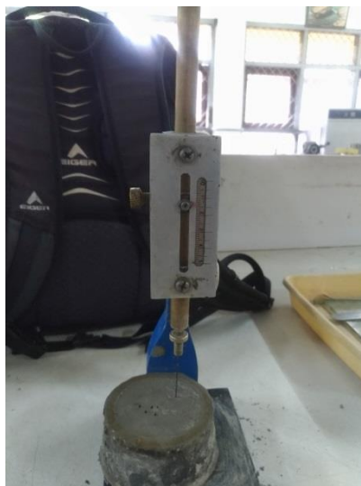
Gambar A4. Pengetesan Setting Time Pasta