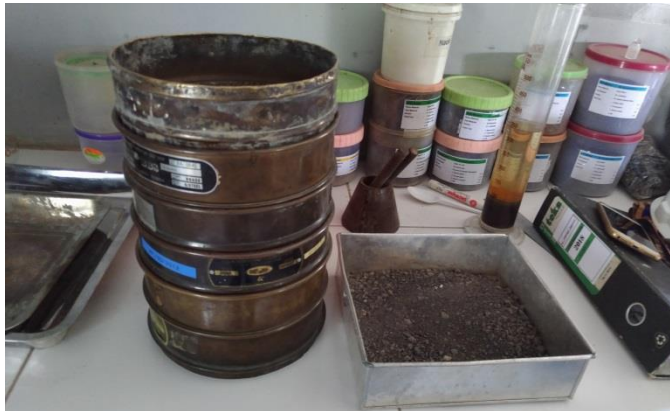
Gambar A1. Persiapan Material