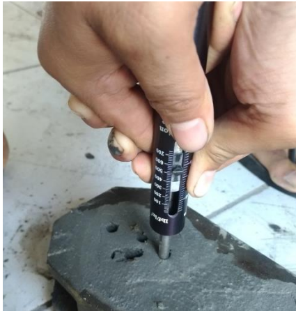
Gambar A3. Pengetesan Setting Time Mortar