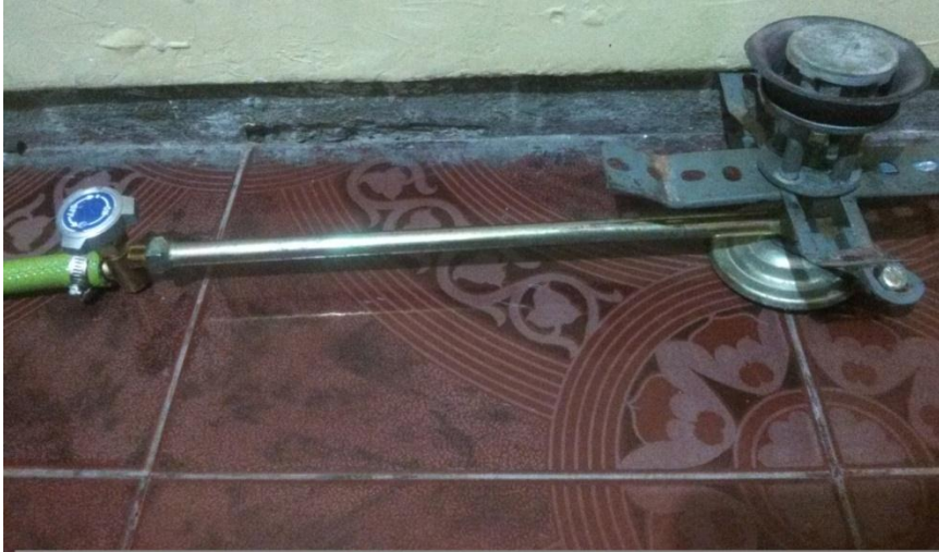
Burner Non Premix type Semawar 202