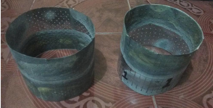
Selubung Udara 1 dan 2