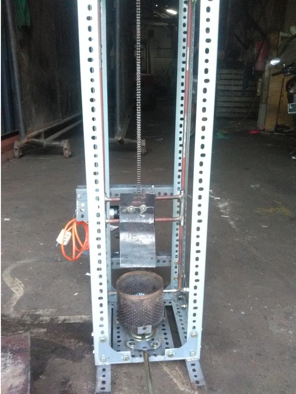
Stand Alat Ukur