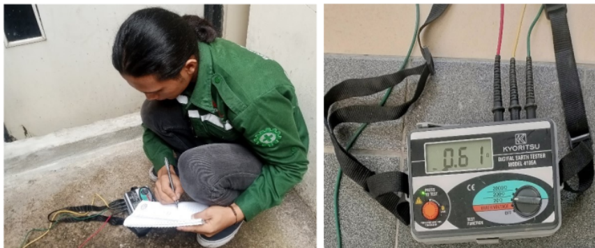
Figure 1. Measuring Soil Resistivity with Earth Tester