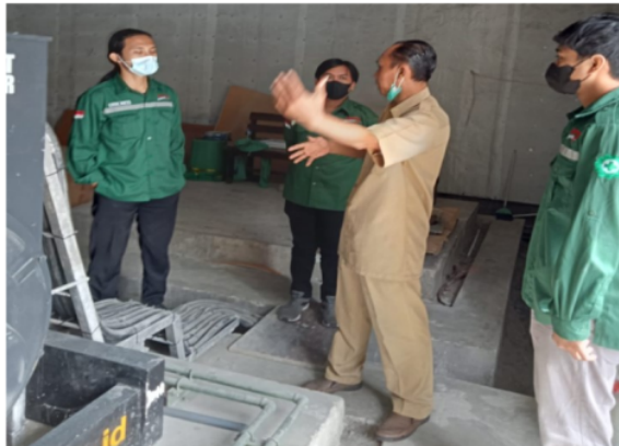
Figure 1. Interview with the Technical Team of Haji Regional Hospital, East Java