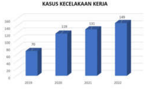
Figure 1. Number of Work Accident Cases at PT. Pelabuhan

One of the reasons why PT. Pelabuhan does not periodically evaluate the Occupational Safety and Health Management System (SMK3) due to the lack of attention from the HSSE management of PT. Harbor. Another reason is due to time constraints. Within PT. Pelabuhan fast-paced ports, companies often face heavy workloads and tight schedules. Implementation of SMK3 audits at PT. Pelabuhan that are not carried out by applicable government regulations has had the impact of increasing cases of work accidents and the incompatibility of their practical implementation in the last 10 years. In the operation of PT. Pelabuhan in 2022, there will still be several cases of work accidents that cause injury or non-injury. Based on the management data of PT. Pelabuhan, there were 149 cases of work accidents. The following is an infographic of work accident cases in the 2019-2022 timeframe according to PT. HSSE Performance data. Harbor: