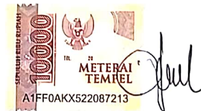
Salsa Billa Bulan Putri Effendi