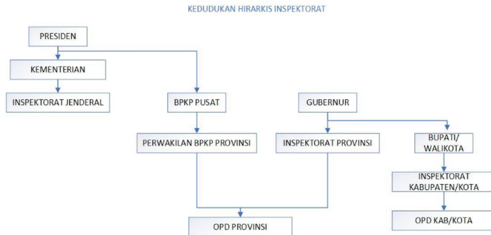
Figure 4.2 Hierarchical Position of the Inspectorate

The concept of hierarchical constitutional status and the pattern of accountability for the authority of the Inspectorate's internal oversight can be analyzed by how the mechanism for managing state finances from the center to the regions, includes the positions of officials managing the state budget and internal oversight institutions which can be illustrated in the following chart: