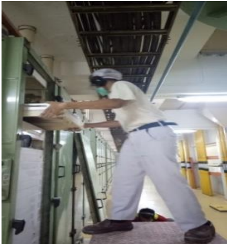
Pergantian Cover Tepung Sifter R1G dan R1F