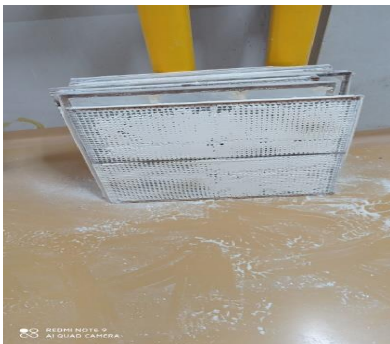
Cover ngeblok tepung tidak bisa terayak