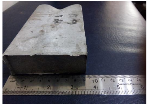
Tinggi specimen 9 cm