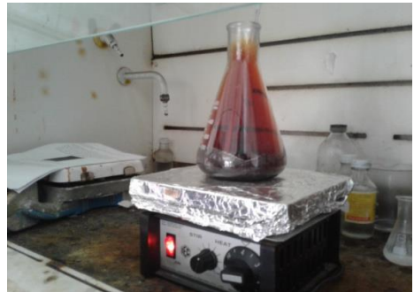
Proses electroless plating