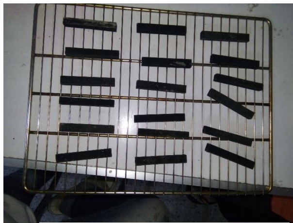
Hasil setelah proses perlakuan panas