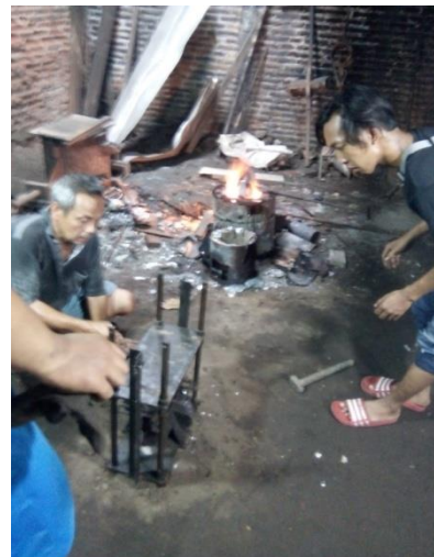
Proses Squeeze Casting