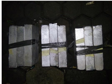
Hasil jadi setelah proses pengecoran