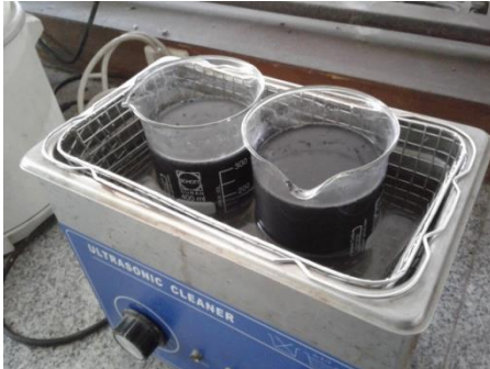
Ultra Sonic Cleaner